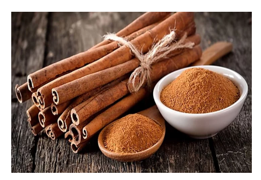
The Unusual Link Between Cinnamon And Diabetes (Watch) diabetes-relief.club