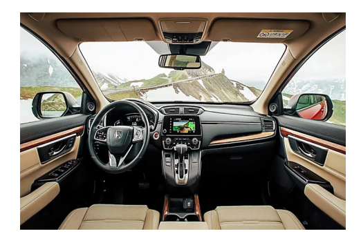
Simply stunning! The 2019 Hondas Are Incredibly Futuristic! Fageo