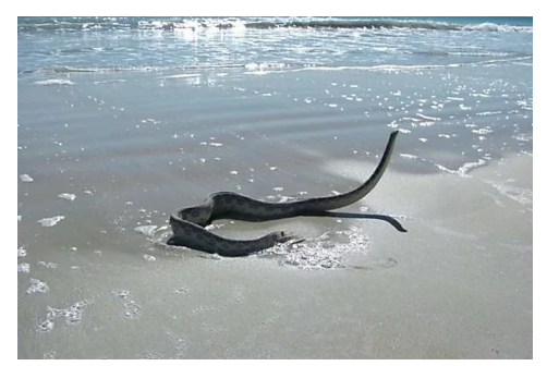
[Pics] No One Realizes How Dangerous This Popular Vacation Spot Actually Is