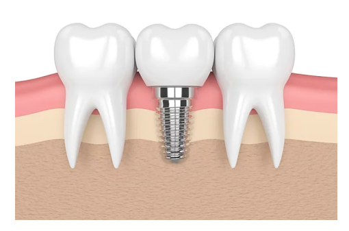
Senior Citizen? - Here Is What New Dental Implants Should Cost You in 2019