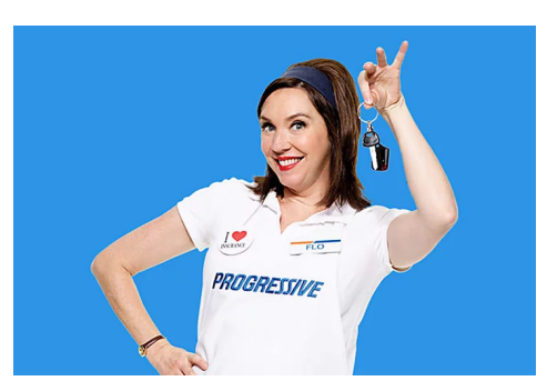
You could save $699 on car insurance when you switch Progressive