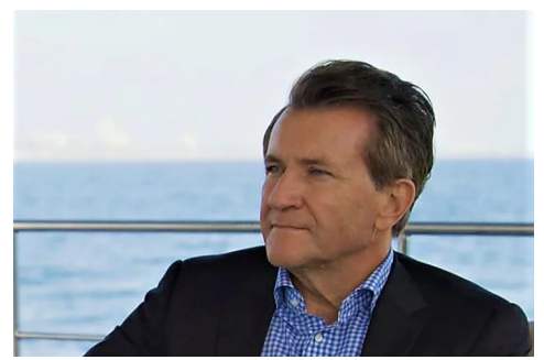
Invest like Herjavec – Start with just $50