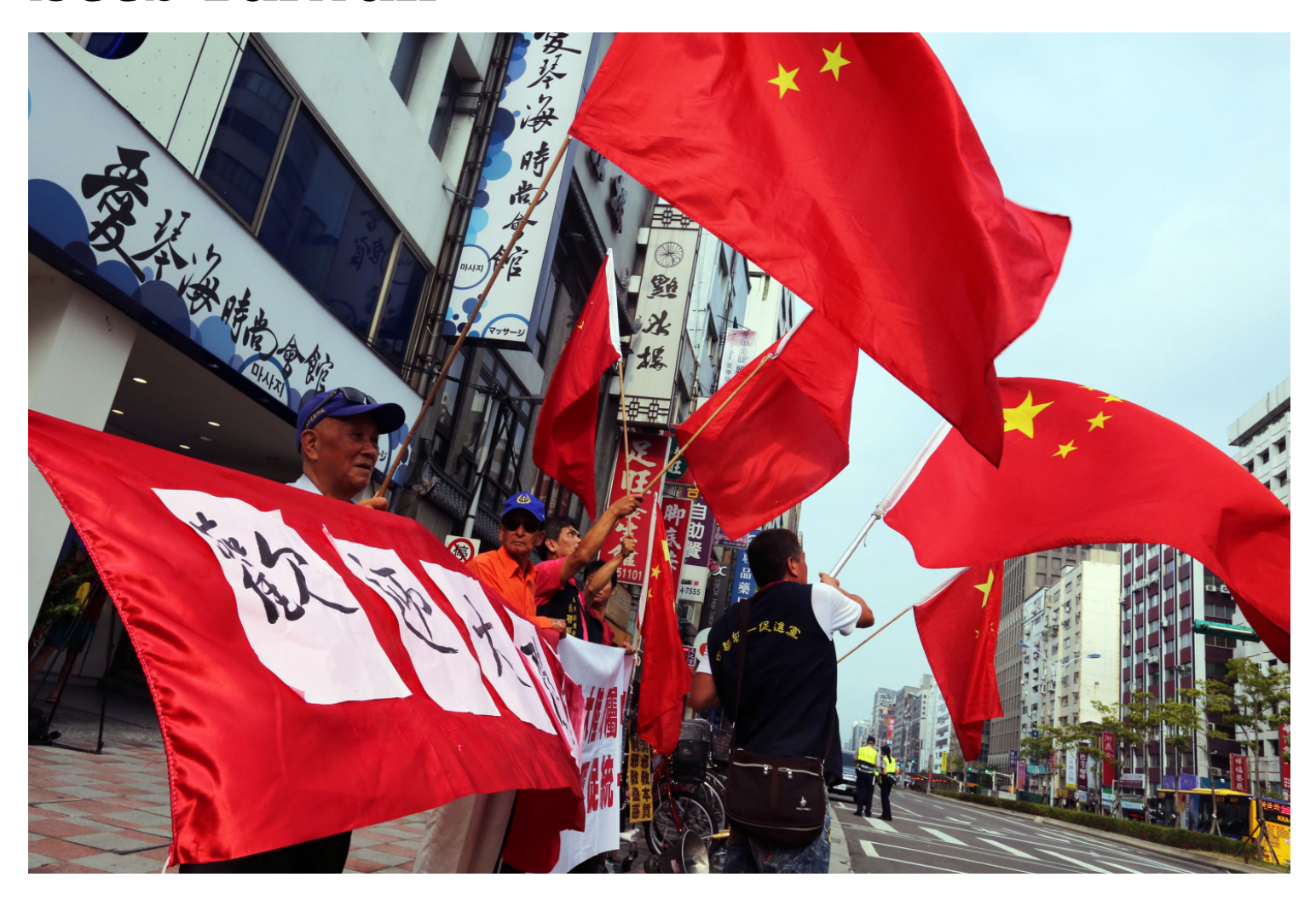
Tags: China, Taiwan, Security, Military, PLA, Topic: Politics Region: Asia April 29, 2018 People's Liberation Army, Beijing, Xi Jinping, Taipei

For the Chinese Communist Party, Taiwan represents the final obstacle to truly concluding the Chinese Civil War.